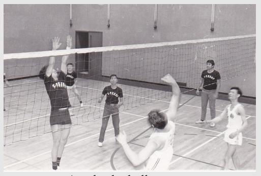
At a basketball tournament