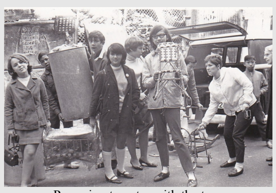
Preparing to enter with the toys