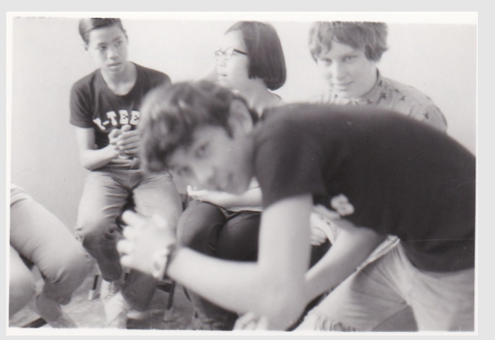
Inside the camp building