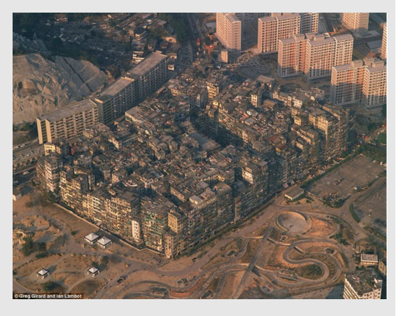
An aerial view of the Walled City