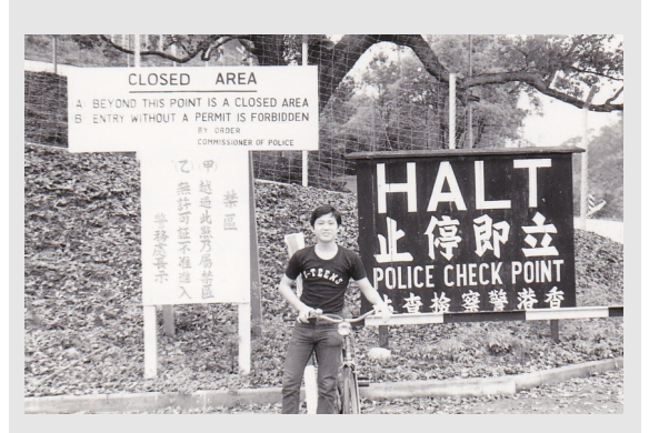
Bike ride outing

While waiting for the train at the station Shatin